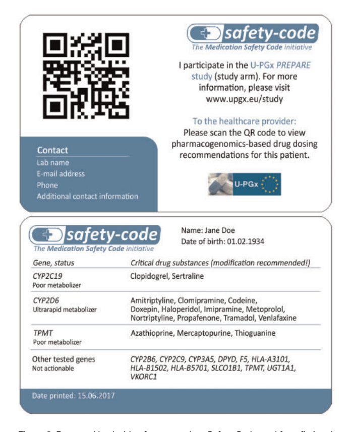
Figure 3. Front and back side of an exemplary Safety-Code card for a fictional patient recruited in the U-PGx project

While a final reflection and assessment of our implementation efforts can only be conducted after completion of the project, we nevertheless want to share the most important experiences collected over the course of this initial project phase.