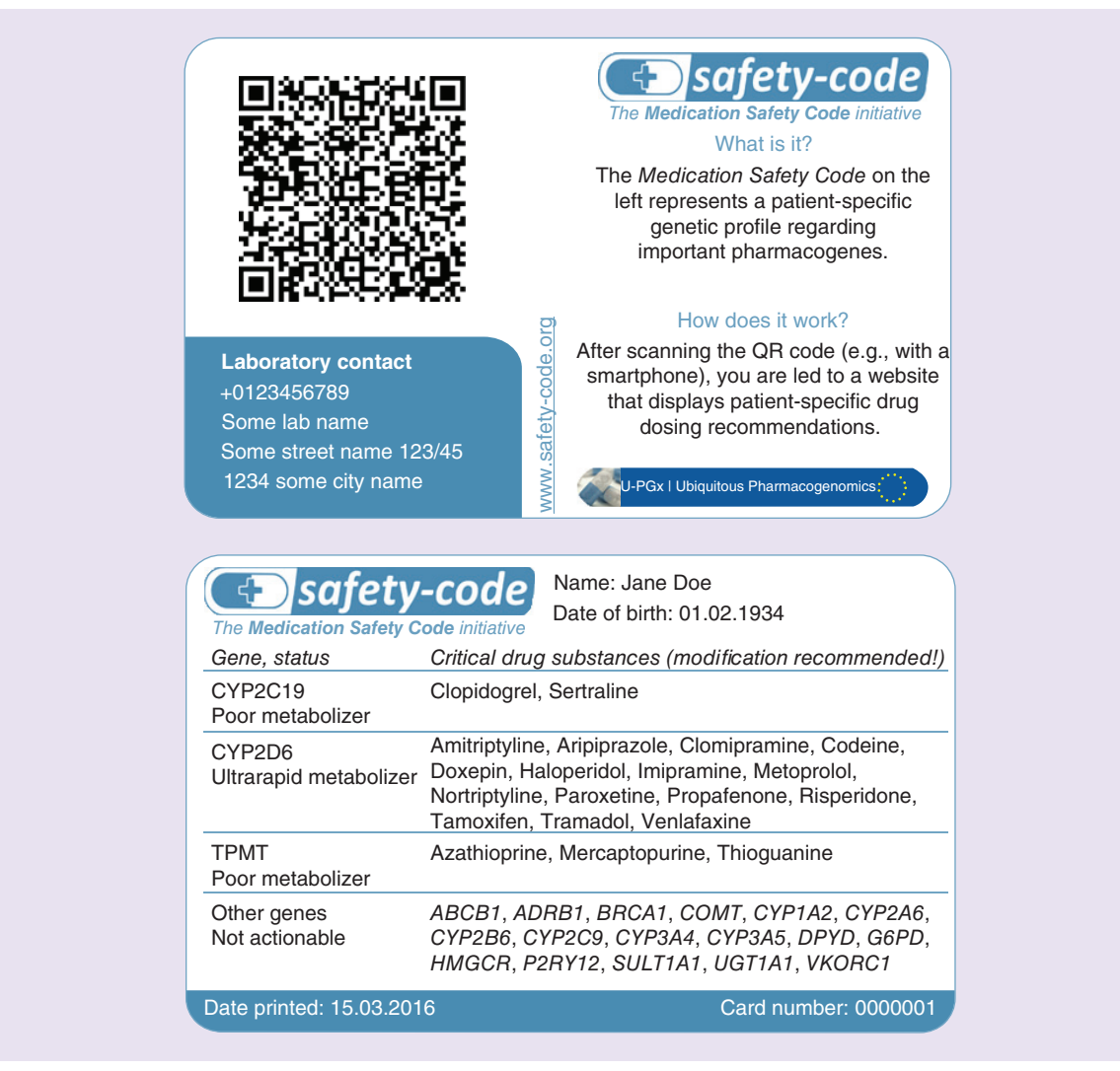
Figure 2. The Safety Code Card contains pharmacogenetic information and a QR code, which can be scanned and will lead the medical professional directly to a website that provides recommendations customized to the PGx profile of that specific patient.

PGx: Pharmacogenomics Data taken from [20].